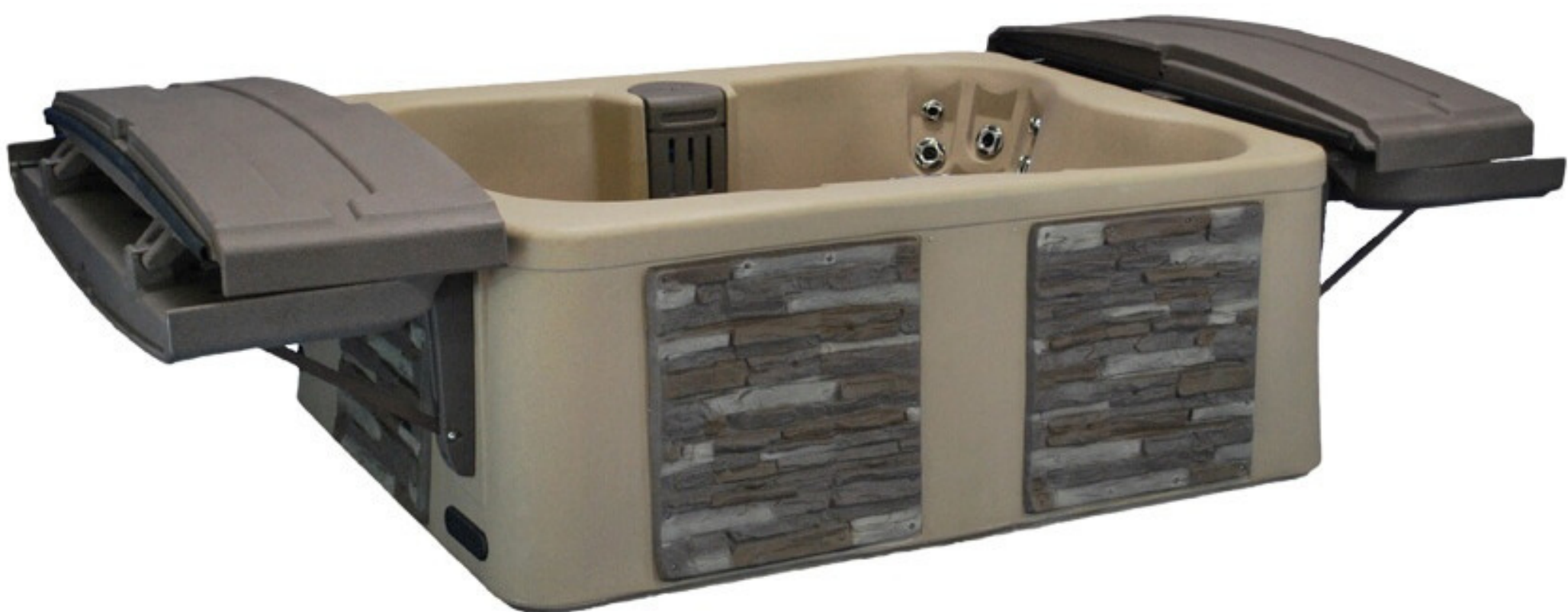
TUFF Spa model from All-American Recreation

Many people cannot afford to pay for a hot tub outright, so they pay in installments. Some spa dealers offer interest-free financing plans. However, you must read the contract carefully. Oftentimes in order to be able to offer this kind of financing, the price of the hot tub has been increased.